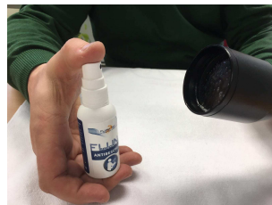
Spray Anti Fog