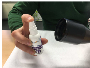
Isopropanol / drying